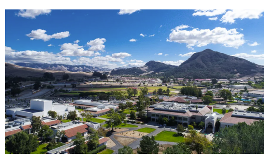
A view of Region VI's Cuesta College.